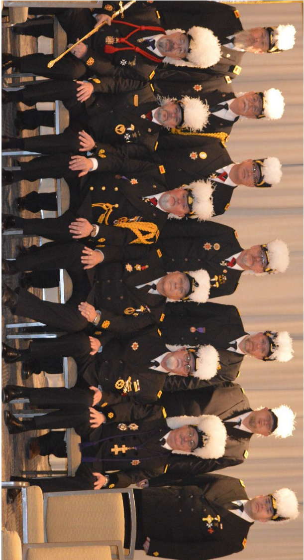
GRAND COMMANDERY KNIGHTS TEMPLAR OF ALABAMA APPOINTED AND ELECTED OFFICERS 2025-2026