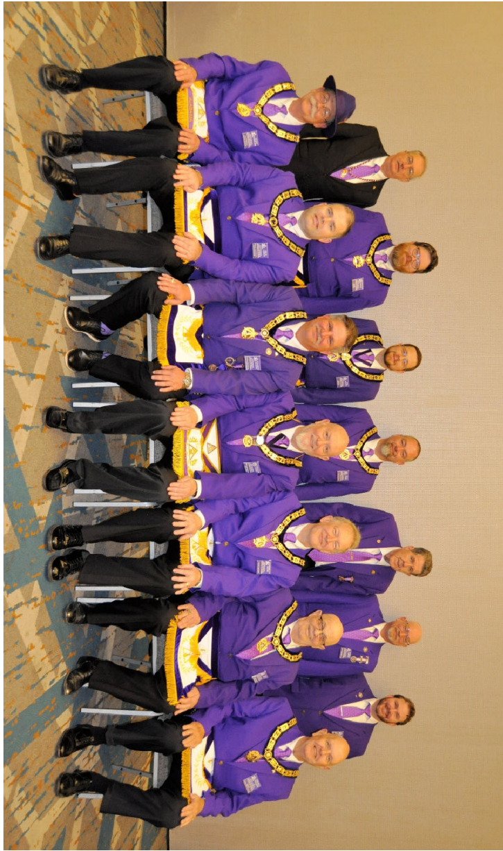
GRAND COUNCIL OFFICERS ROYAL AND SELECT MASTERS OF ALABAMA ELECTED AND APPOINTED 2023-2024