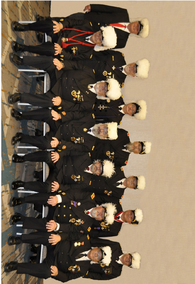
GRAND COMMANDERY KNIGHTS TEMPLAR OF ALABAMA APPOINTED AND ELECTED OFFICERS 2023-2024