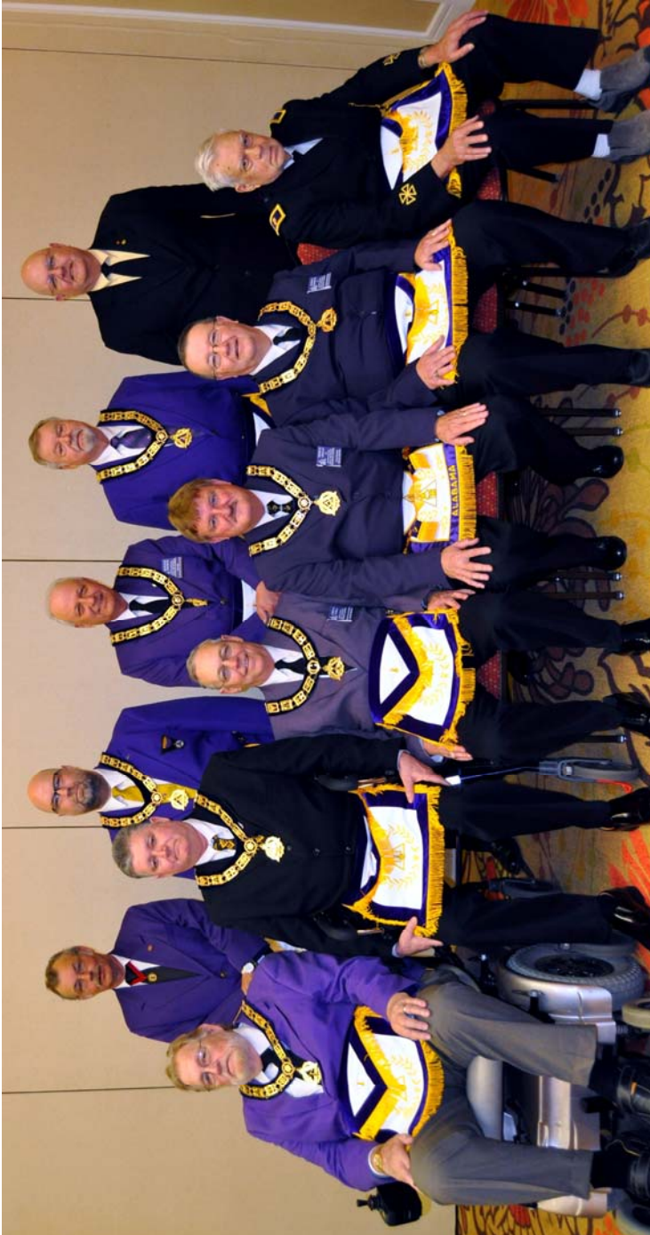
See Next Page for Legend of Members in Picture