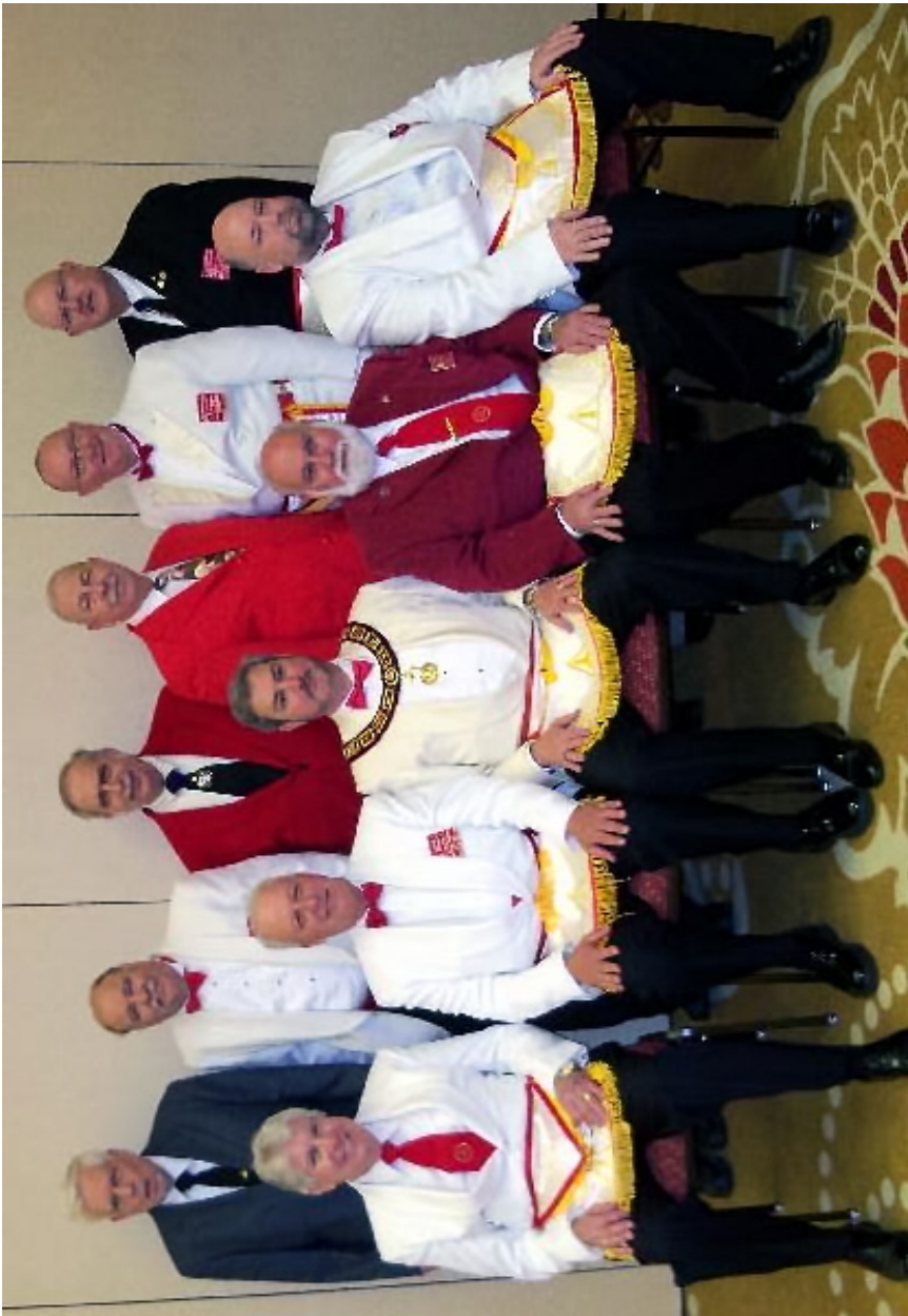
See Legend on Next Page for Names of Officers in Picture