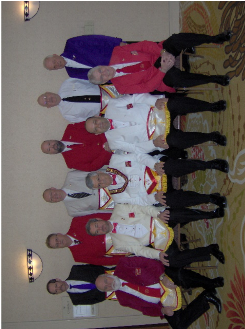
See Legend on Next Page for Names of Officers in Picture